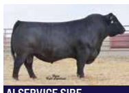
AI SERVICE SIRE