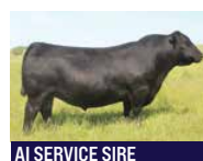
AI SERVICE SIRE

ROYAL ADAPTOR DRCC 8094U D: PM ANNIE K 126'13 HF ANNIE K 4X