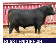
BLAST ENCORE 4H

D: PM TIBBIE 48'15 POPLAR MEADOWS TIBBIE 14'11