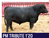
PM TRIBUTE 1'20

Twin is previous lot. 148H exposed to PM Tribute 117'20 from April 27 to August 15. PM Tribute 117'20 and PM Tribute 1'20 with group from June 7 to August 15. Vet called 148H 4+ months (Sept 1).