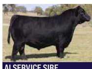
AI SERVICE SIRE

A very nice Merit Sting daughter out of an Aviator cow and going back to the donor cow Crowfoot Pearl 8006U. Moderate in size and tanky. The Aviator cows continue to rise to the top and seem to mate well with almost all sires. AI Bred April 20 to Conley South Point. Exposed May 20 to August 15 to Riverfront Stunner 021H. June 7 to August 15 to Blast Encore 4H. Vet called 3.5 months (Sept 1).