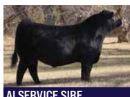
AI SERVICE SIRE

This would be a heifer designed to become a great cow. Dam is a model Angus cow that every visitor asks who she is. This calf weaned off 8/77 in her pasture. The Executive 2 year olds have done a good job on their calves with nice feet and udders and moderate size for the most part. AI Bred May 1 to Chestnut Turning Heads. May 20 to August 15 to Riverfront Stunner 021H. June 7 to August 15 to Blast Encore 4H. Vet called 4+ months (Sept 1).