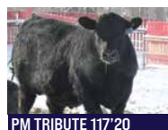
PM TRIBUTE 117'20

A good heifer off of an SAV Final Answer daughter. We purchased this heifer from our good friends Diane and Chuck of Mountain Ash Angus and she goes back to my parents Lady Heather cows. This cow is also behind the 8H heifer as well. Very quiet heifer. Exposed to PM Tribute 117'20 from April 27 to August 15. Exposed to PM Tribute 1'20 from June 7 to August 15. Vet called 4+ months (Sept 1).