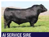
AI SERVICE SIRE

An Executive Decision bred heifer out of the Blossom cow family. Bred early to Coleman Bravo and a great opportunity to make you a return on investment. AI Bred April 20 to Coleman Bravo. Exposed May 20 to June 7 to Riverfront Stunner 021H. Exposed June 7 to August 15 to PM Denver 295'19. Vet called 4+ months (Sept 1).