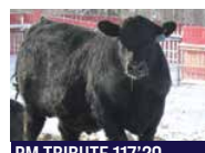
PM TRIBUTE 117'20

A middle of March heifer out of a now 14 year old cow we purchased at the Southland dispersal sale. We halterbroke Jewel as a mature cow and showed her throughout western Canada and she won several Supreme's. This heifer is attractive made and I see the phenotype of her dam shining through. Exposed to PM Tribute 117'20 from April 27 to August 15. Exposed to PM Tribute 1'20 from June 7 to August 15. Vet called 4 months (Sept 1).