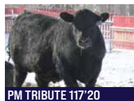
PM TRIBUTE 117'20