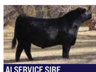
AI SERVICE SIRE

A McCumber Tribute 702 daughter. Both Monty and I were very impressed with the McCumber herd and the consistency of their cows. 150H looks like she will be a great cow and offer something new to most breeders in Canada. The Turning Heads calves come small and have lots of style and grow. AI Bred April 16 to Chestnut Turning Heads. May 20 to June 7 to Riverfront Stunner 021H. June 7 to August 15 to PM Denver 295'19. Vet called 4 months (Sept 1).