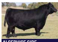
AI SERVICE SIRE

I know I have way too many favourites, but this one is for sure. We all see cattle differently but in my eyes, this is the type I want to breed and own. After calving 2 calf crops of South Points I think this is absolutely the right mating. AI Bred April 17 to Conley South Point. Exposed May 20 to August 15 to Riverfront Stunner 021H. Exposed June 7 to August 15 to Blast Encore 4H. Vet called 4 months (Sept 1).